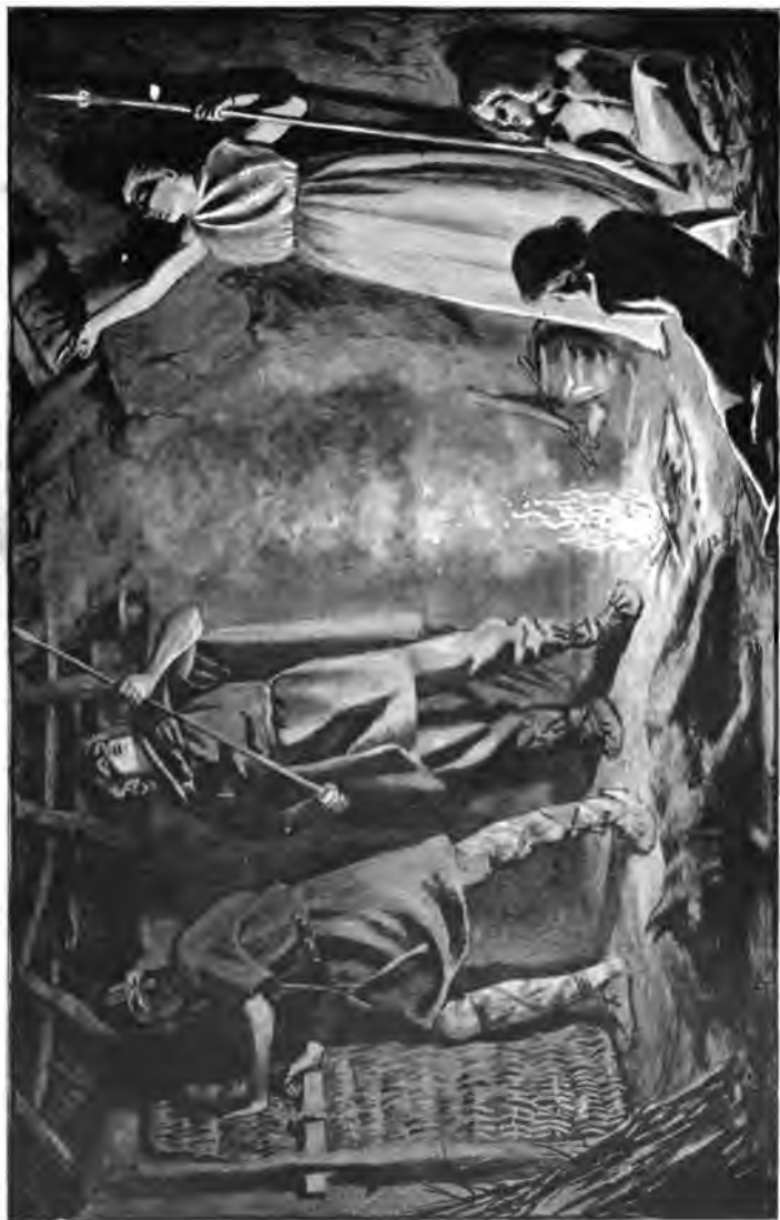
BERIC KEEPS THE WOLVES AT BAY